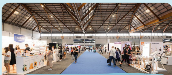
Aisles were increased to 5 metres to support physical distancing.

By dispersing crowds through strategically planned session times and additional venue space thanks to Sydney Showground's COVID-19 support options , PBCE Sydney could reach its desirable attendance figures and be one of the first organisations to bring exhibitions back to life in Sydney under NSW Government event safety guidelines.