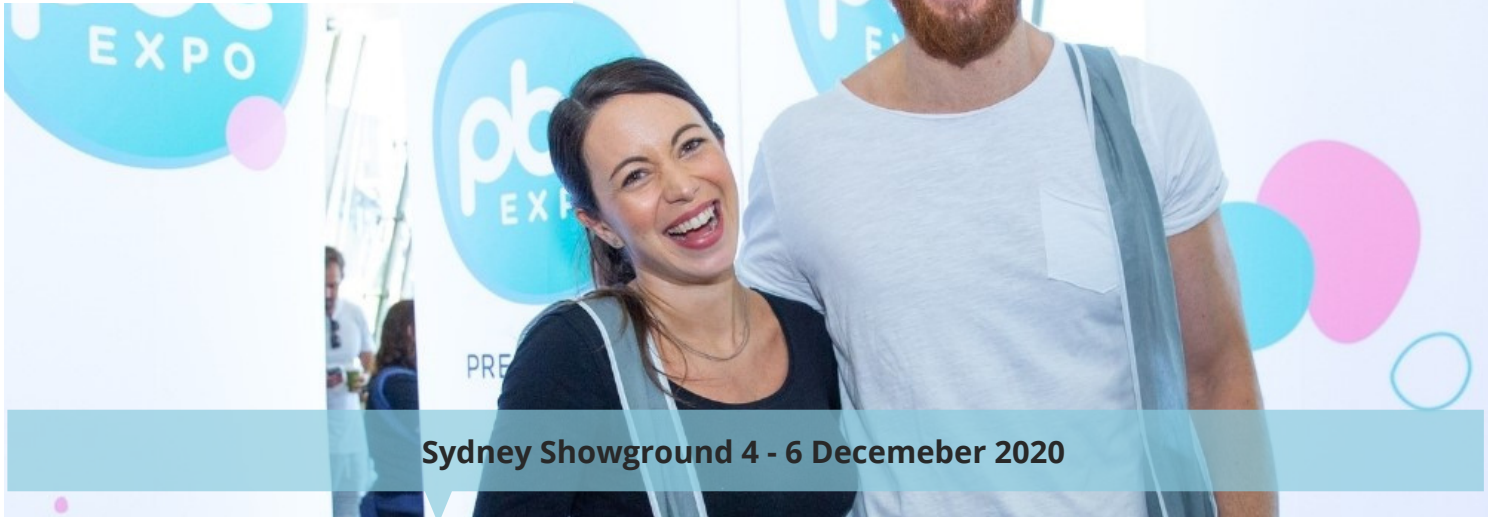
Sydney Showground 4 - 6 Decemeber 2020