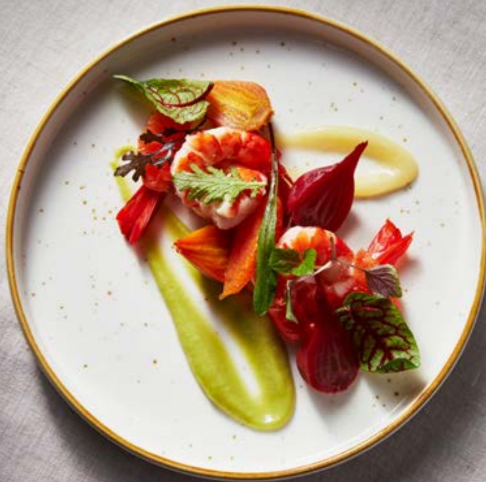
Gold Coast Marine Aquaculture tiger prawn, silky avocado and flamed mirin, Yuzu gel, sesame.

From bespoke catering options for exhibitions and formal gala dinners, to accessing the venue's network of concessionaires and food truck alternatives for a more relaxed affair, Sydney Showground has the unique expertise to curate the perfect menu for any event—whether you plan to welcome 150 or 50,000.