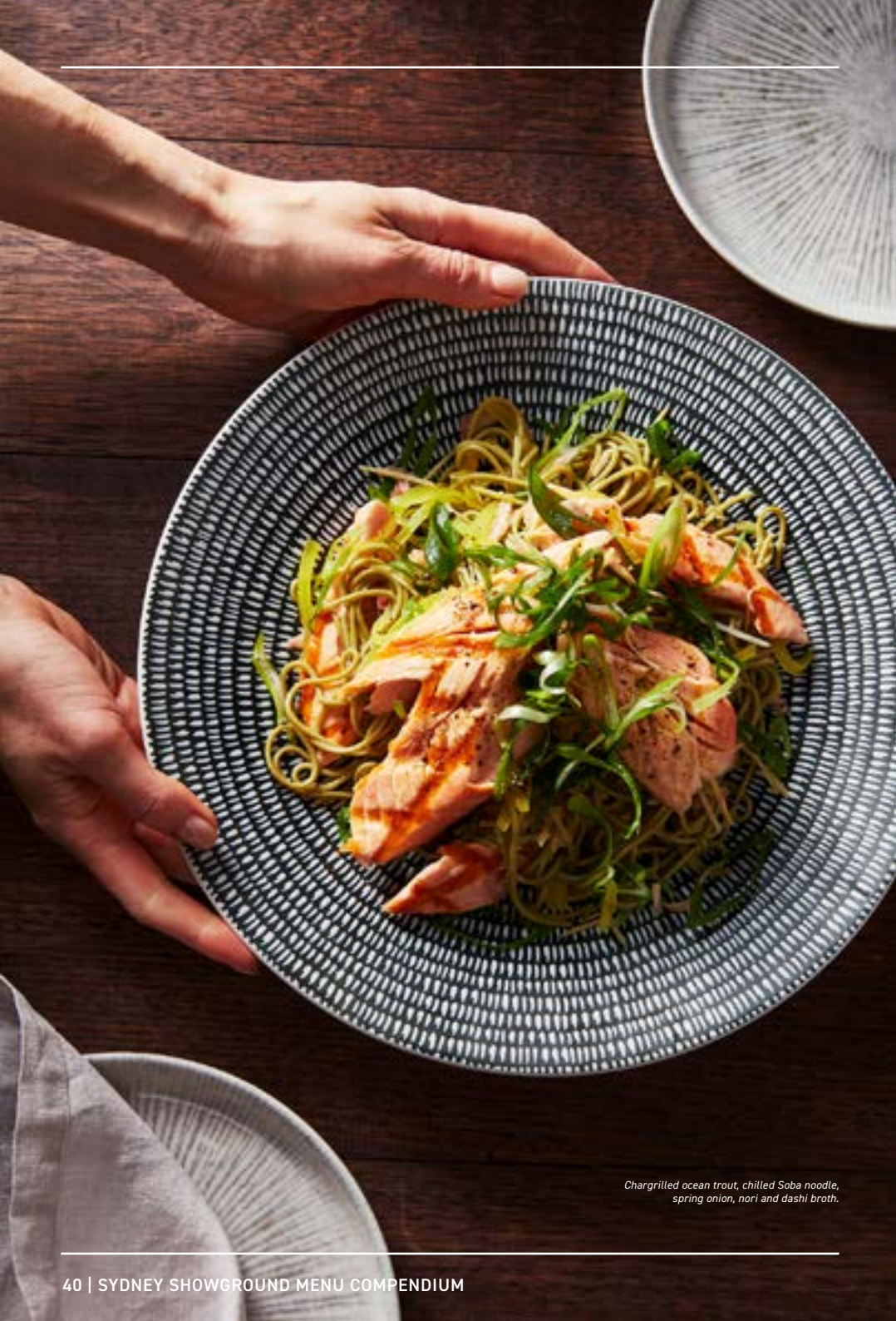
Char-grilled ocean trout, chilled Soba noodle, spring onion, nori and dashi broth.