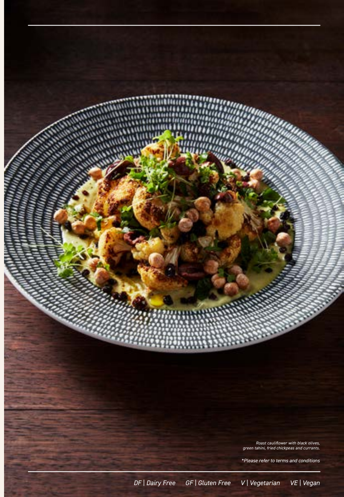
Roast cauliflower with black olives, green tahini, fried chickpeas and currants.