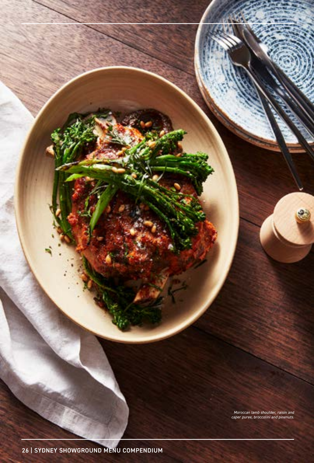
Moroccan lamb shoulder, raisin and caper puree, broccolini and pinenuts.