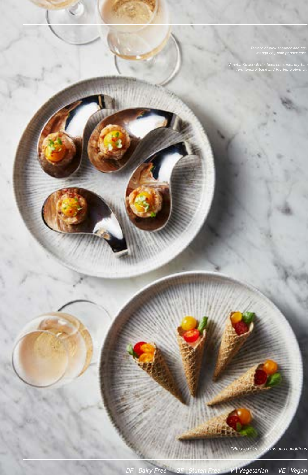
Tartare of pink snapper and figs, mango gel, pink pepper corn.