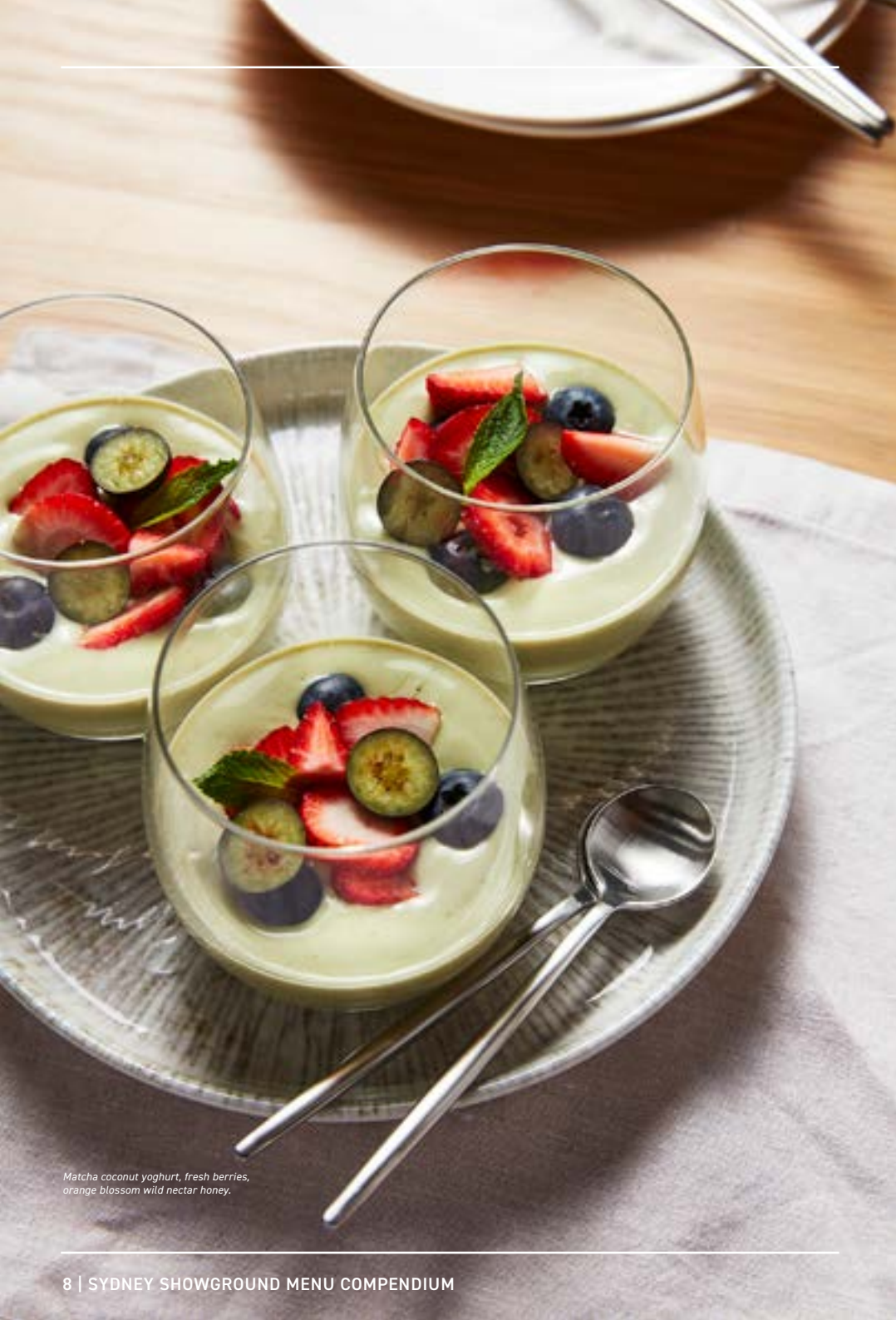
Matcha coconut yoghurt, fresh berries, orange blossom wild nectar honey.