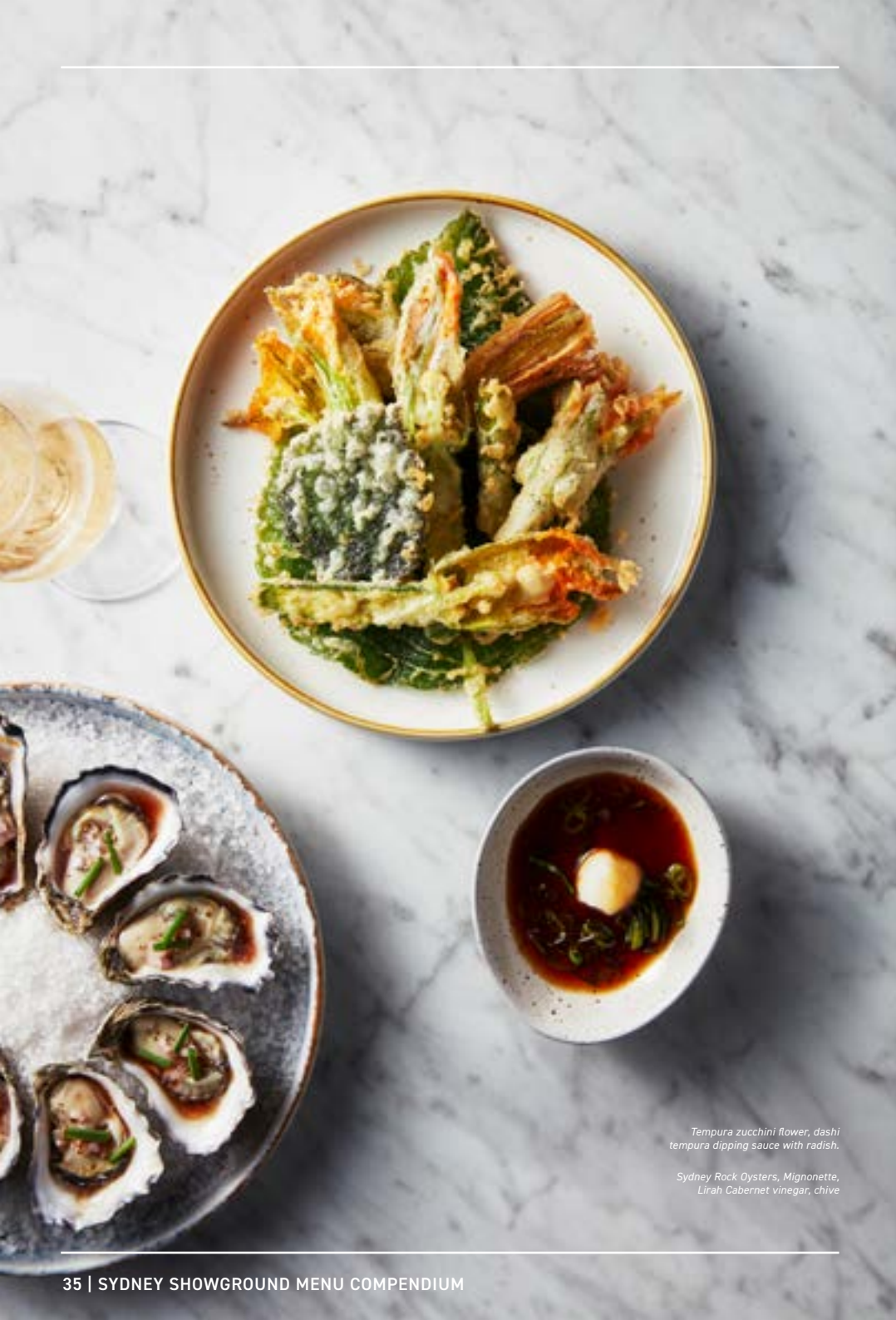
Tempura zucchini flower, dashi tempura dipping sauce with radish.