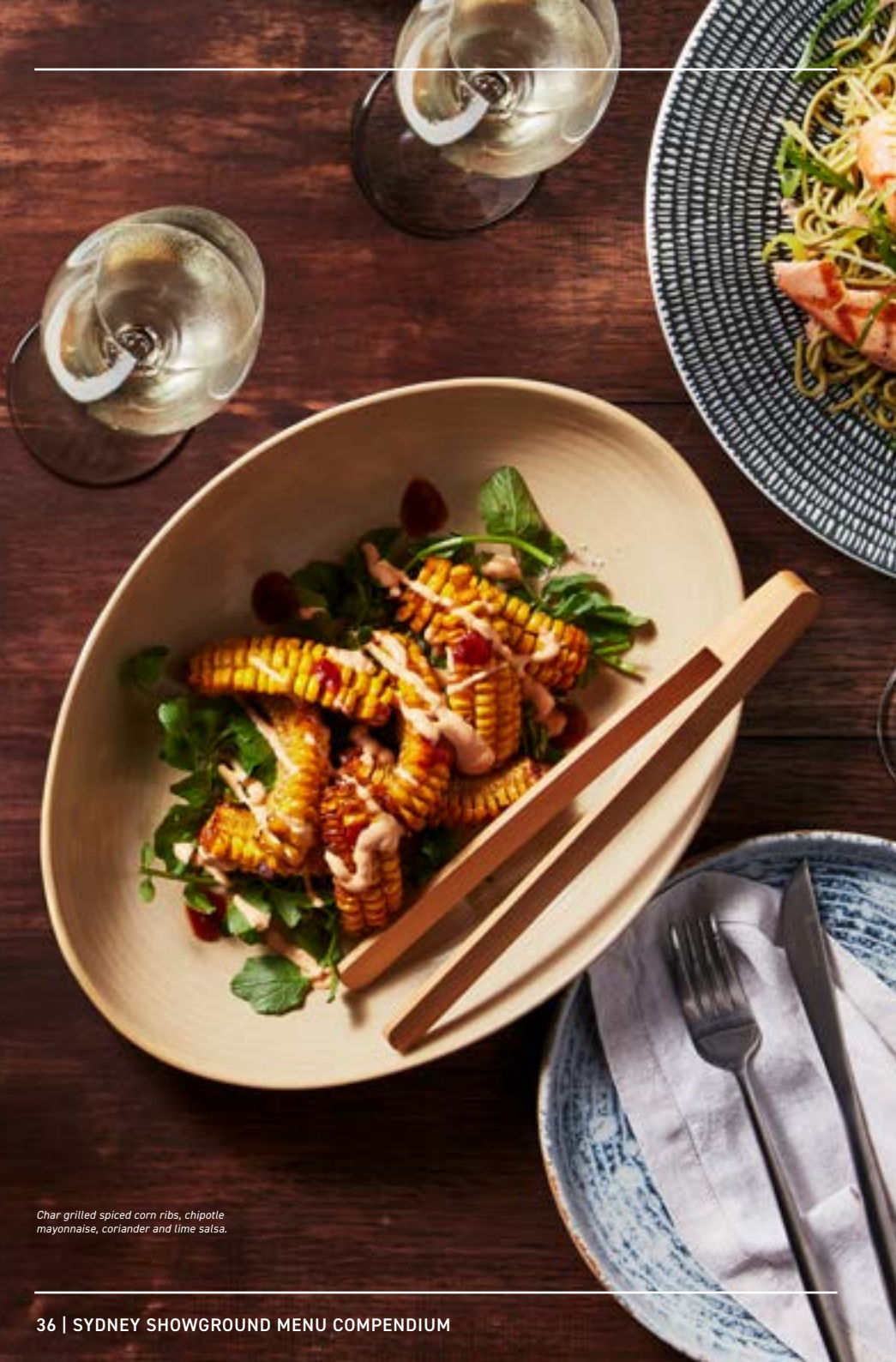
Char grilled spiced corn ribs, chipotle mayonnaise, coriander and lime salsa.