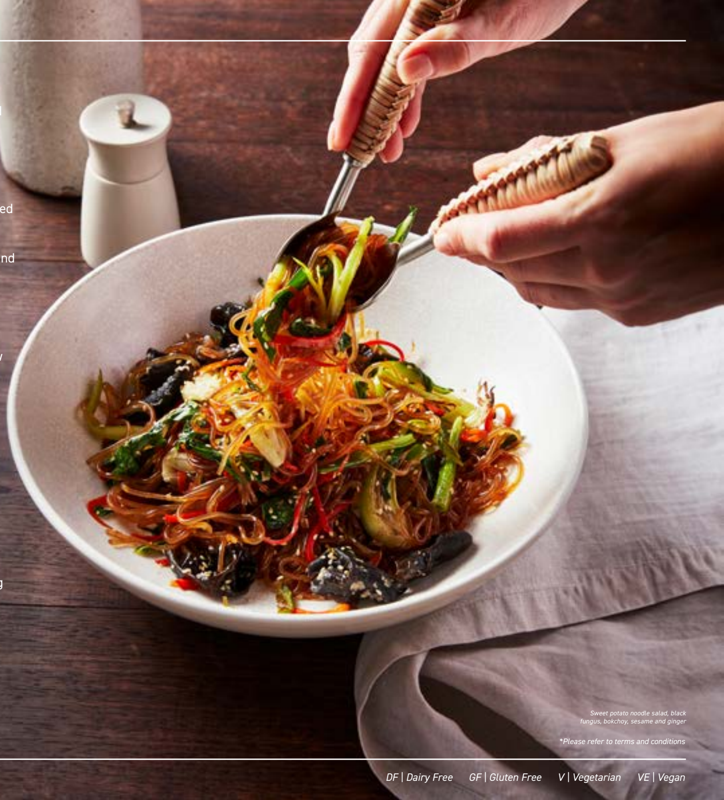
Sweet potato noodle salad, black fungus, bokchoy, sesame and ginger

Garden salad, tomato, cucumber, avocado, aged balsamic dressing GF, VE