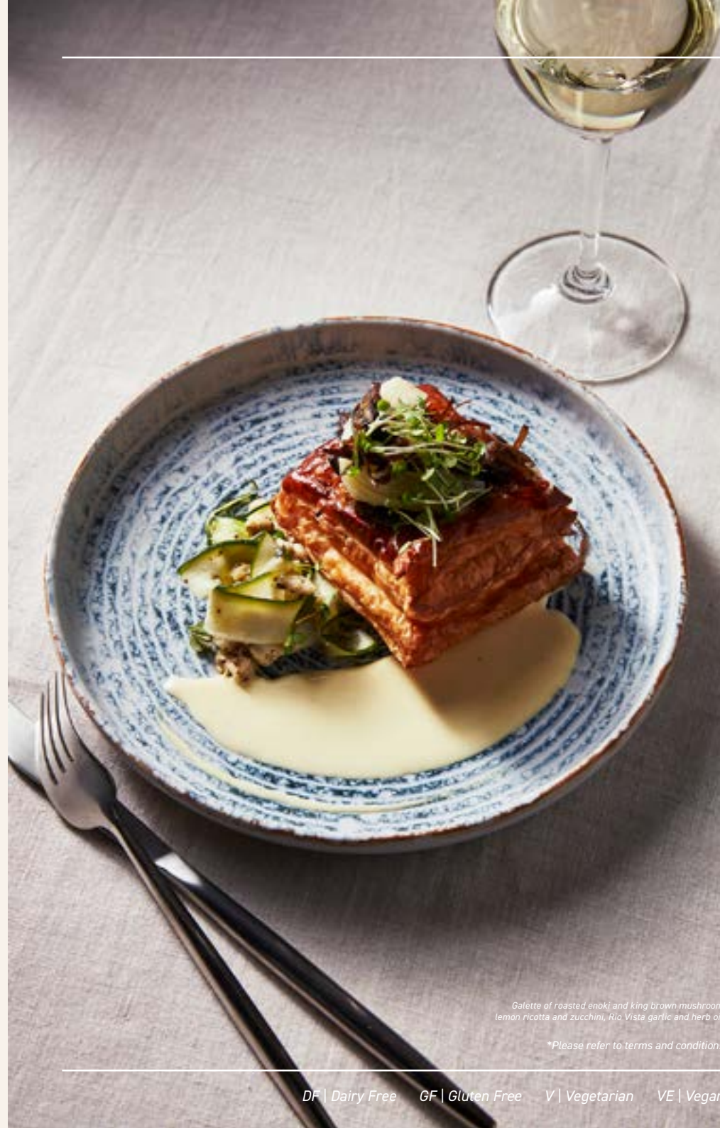
Galette of roasted enoki and king brown mushroom, lemon ricotta and zucchini, Rio Vista garlic and herb oil.

Galette of roasted enoki and king brown mushroom, lemon ricotta and zucchini, Rio Vista garlic and herb oil V