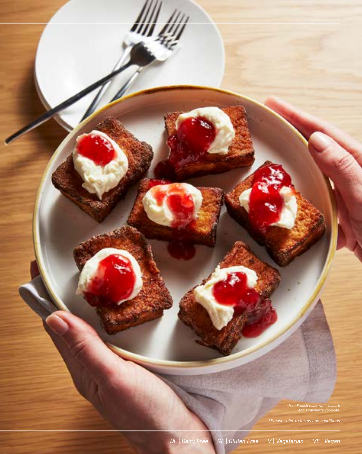
Mini French toast with rhubarb and strawberry compote.

Mini strawberry and banana skewer rolled in maple syrup and macadamia DF, GF, VE