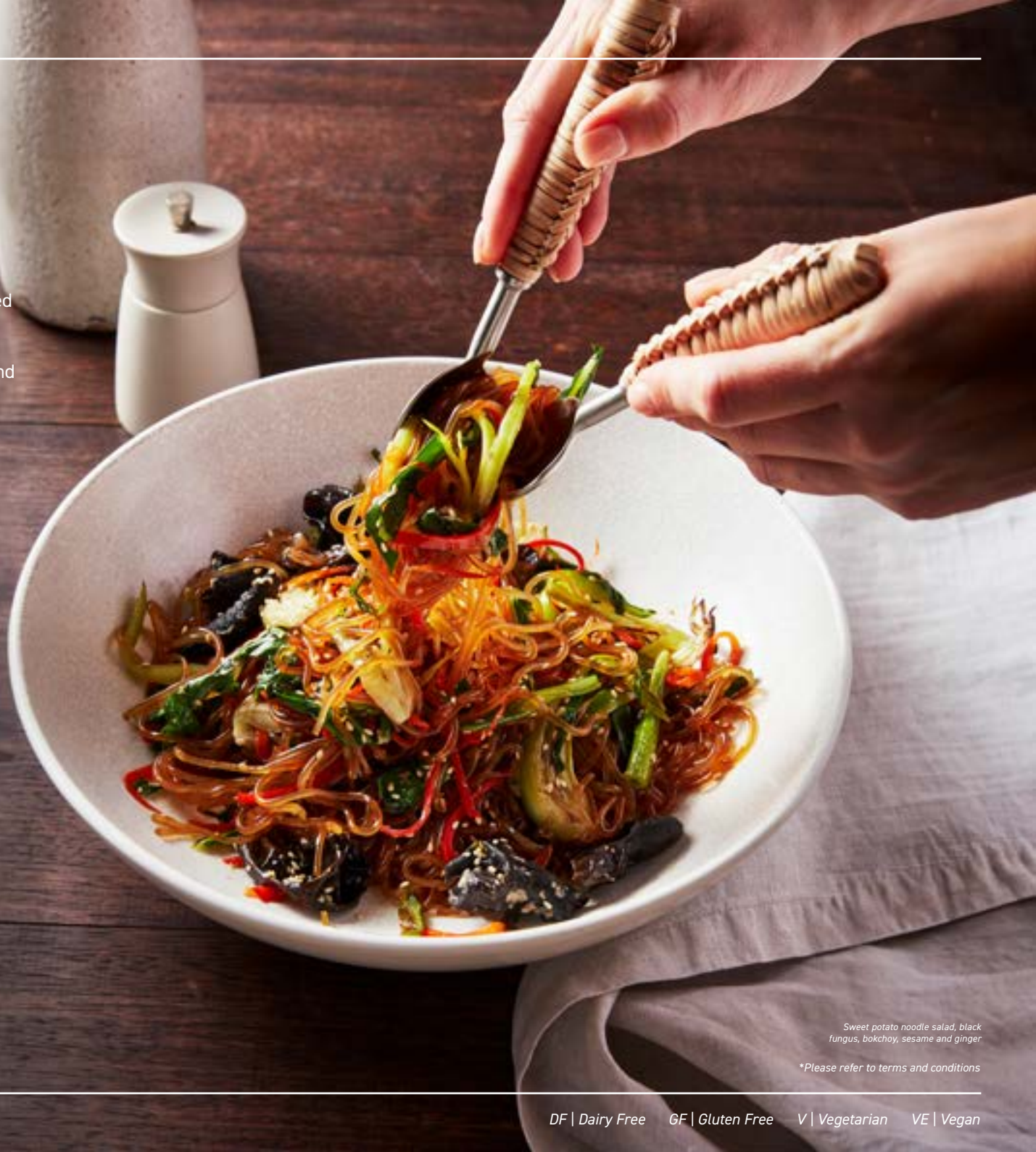
Sweet potato noodle salad, black fungus, bokchoy, sesame and ginger

Garden salad, tomato, cucumber, avocado, aged balsamic dressing GF, VE