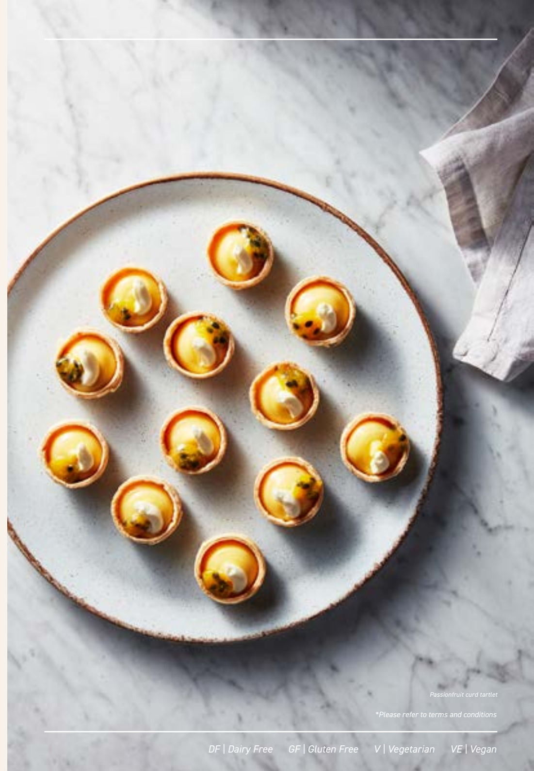
Passionfruit curd tartlet

Annie's beef brisket mini pie with tomato sauce