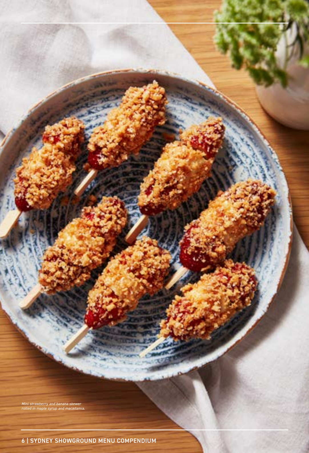
Mini strawberry and banana skewer rolled in maple syrup and macadamia.