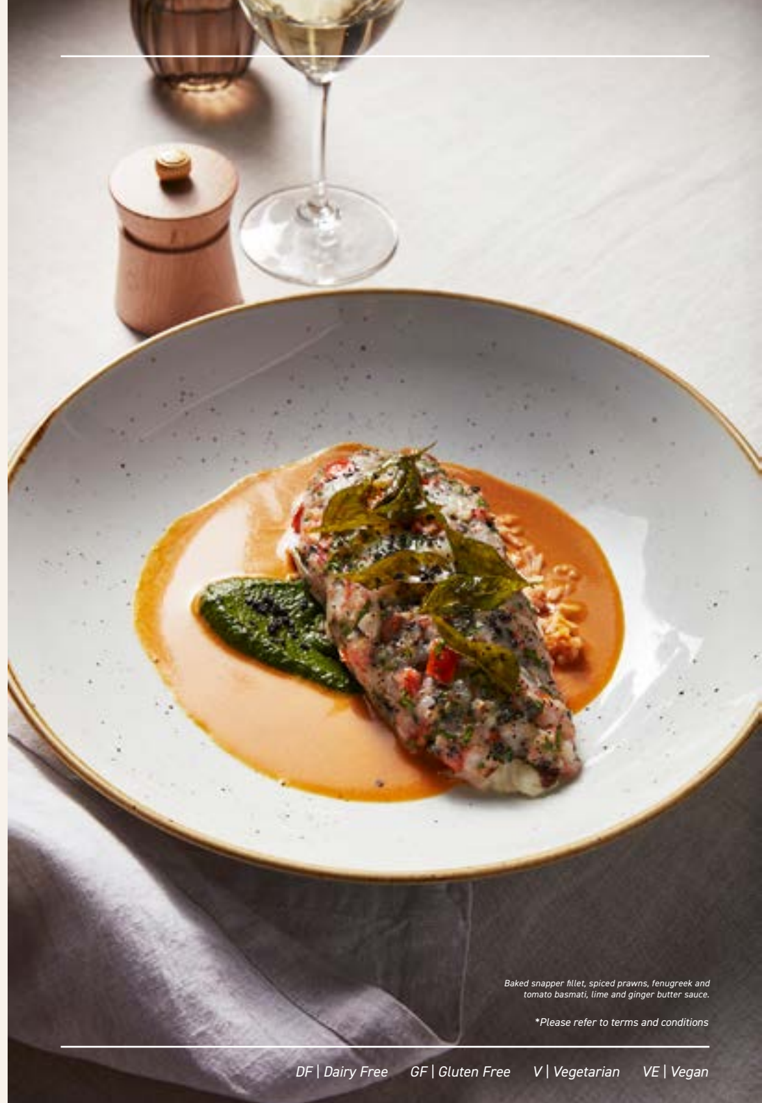
Baked snapper fillet, spiced prawns, fenugreek and tomato basmati, lime and ginger butter sauce.

Soft semolina and Parmesan gnocchi, eggplant and heirloom tomato ragout, basil and rocket pesto V