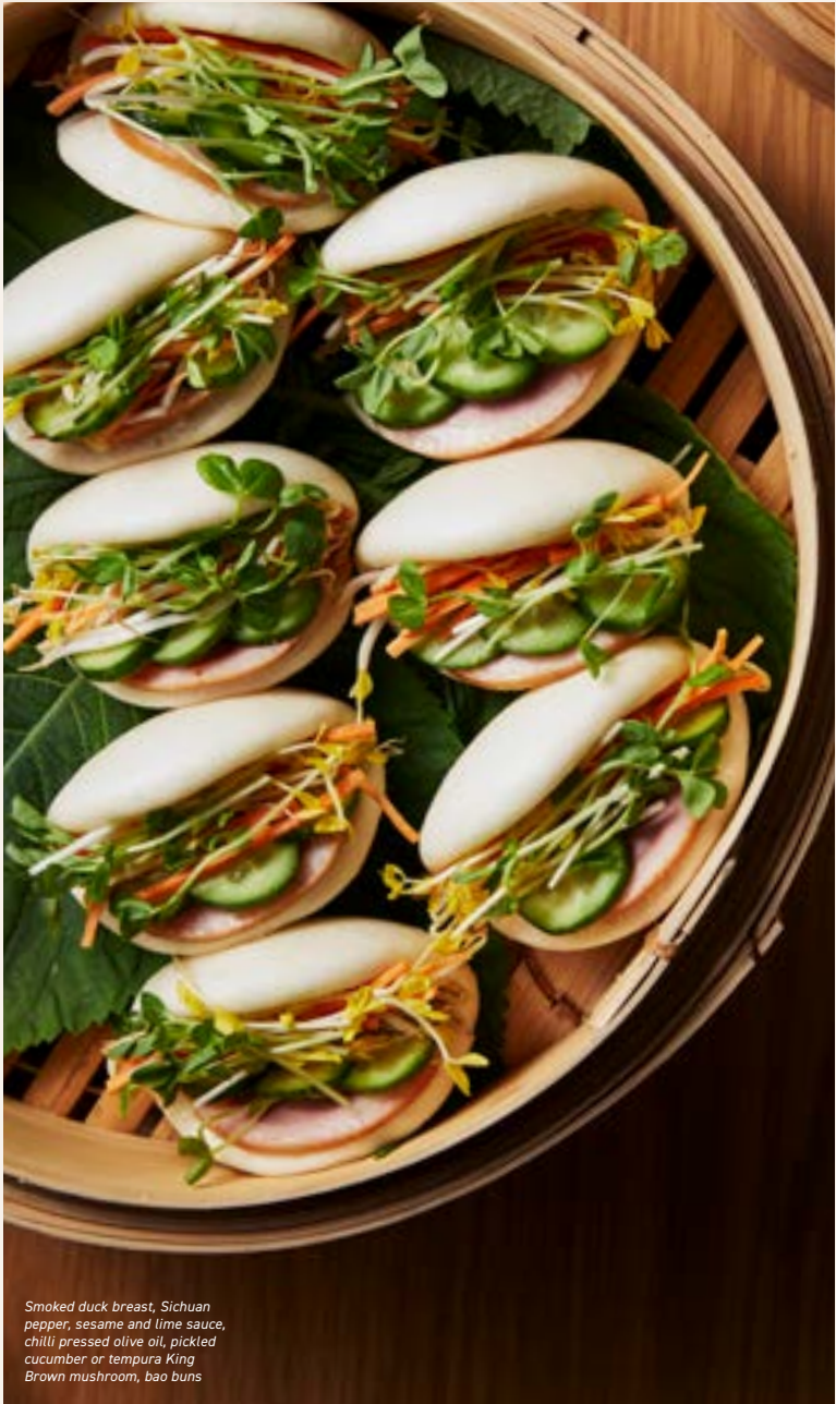
Smoked duck breast, Sichuan pepper, sesame and lime sauce, chilli pressed olive oil, pickled cucumber or tempura King Brown mushroom, bao buns