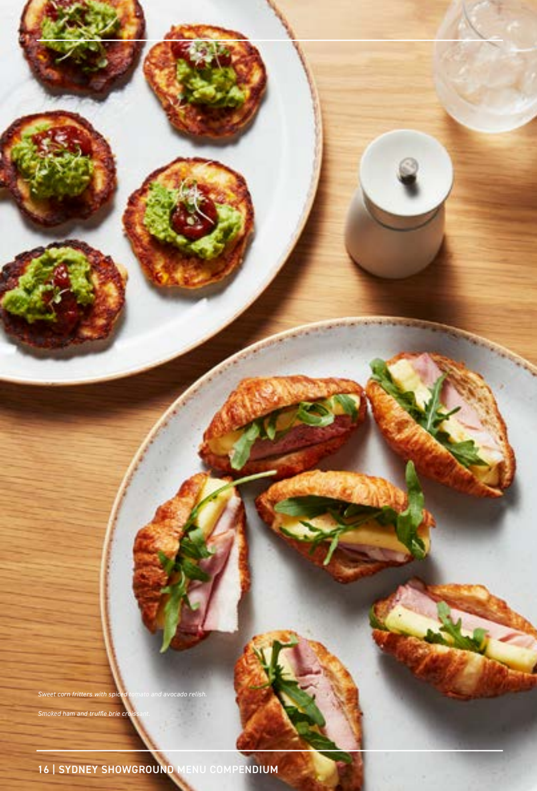
Sweet corn fritters with spiced tomato and avocado relish.