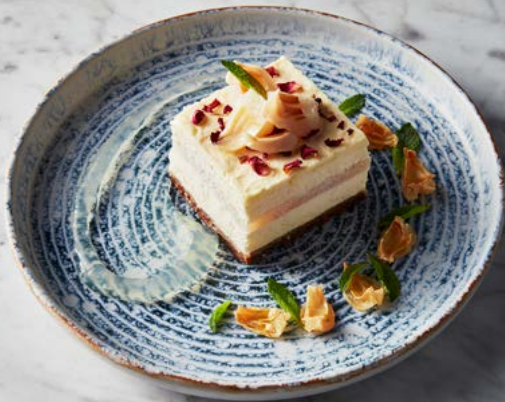
Rose and lychee cake, rose petal and Iranian fairy floss