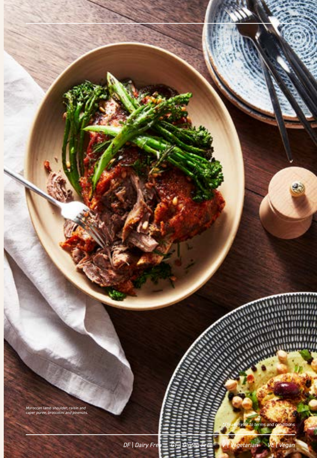
Moroccan lamb shoulder, raisin and caper puree, broccolini and pinenuts.

+ Enhance your conference lunch with a lunch time favourite